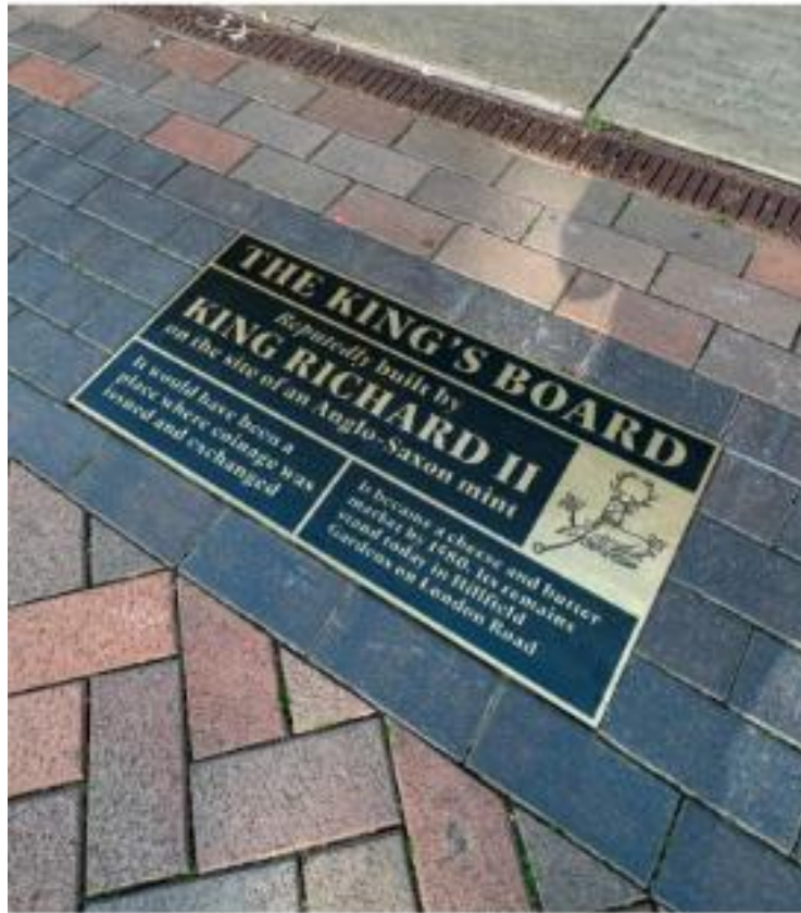
Figure 3: Example of historical and cultural design interpretations